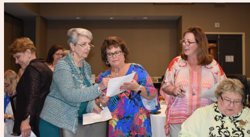
Members seemed to enjoy playing bingo!