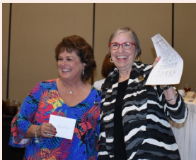
The bingo winner!